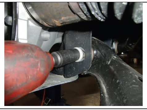
Loosen and remove rear lower control arm bolt and nut.