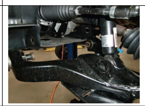
With jack, lower control arm from frame pockets.