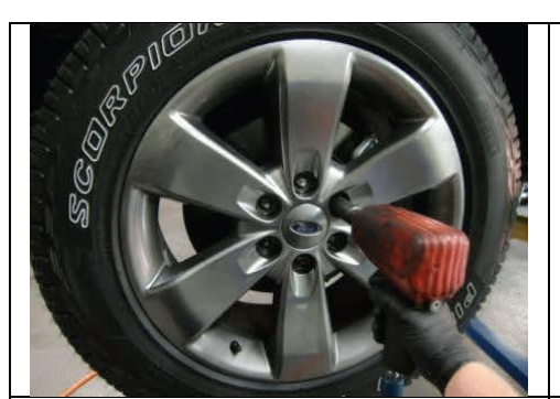
Raise and support front of vehicle off the ground. Remove front wheels/tires, support suspension with jack.