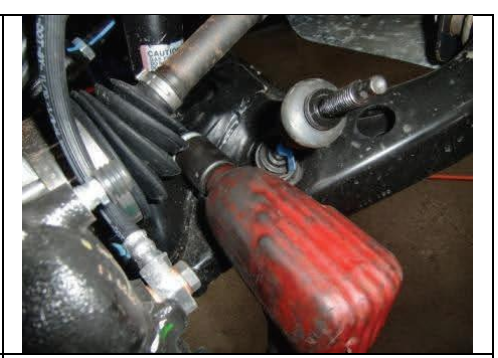
. Disconnect and remove lower shock bolt and nut.