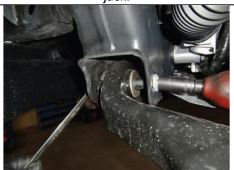
Loosen and remove front lower control arm bolt and nut