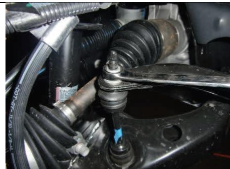
Disconnect upper sway bar end links.