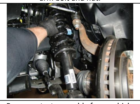
Remove strut assembly from vehicle