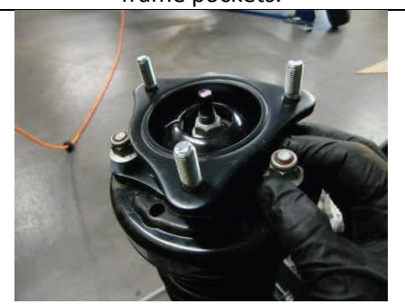
Install new strut extension with GOLD Flange Nuts, tighten.