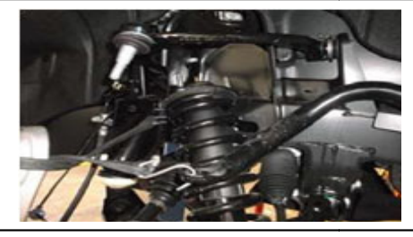
Lift the sway bar out of the way, then remove the strut from vehicle.