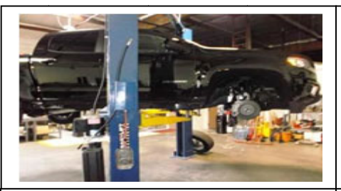
Lift the vehicle by the frame. Then remove the front wheels using a 22mm socket.