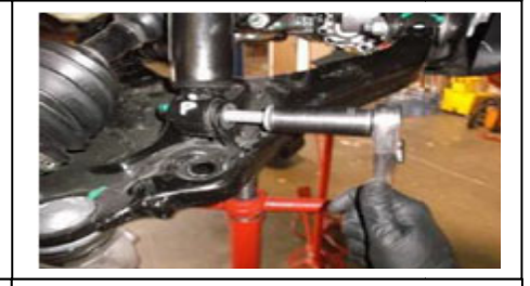
Raise the lower control arm and reinstall the bottom of the strut using a 21mm socket. Torque down.