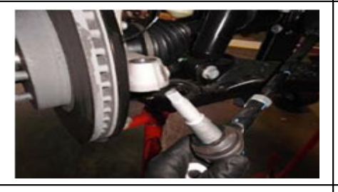
Remove the tie rod ends from the steering knuckle using a 21mm socket. Note: You may need to use a hammer to separate the ball joint from the knuckle.