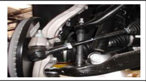
Reinstall the sway bar end links using a 13mm socket for the bottom.

Reinstall the brake line brackets to the frame using a 13mm socket. You may need to lightly bend the brake line brackets to clear the upper control arm.