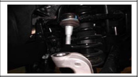
Separate the upper control arm from the steering knuckle using an 18mm socket. Note: the upper control arm will be under tension.