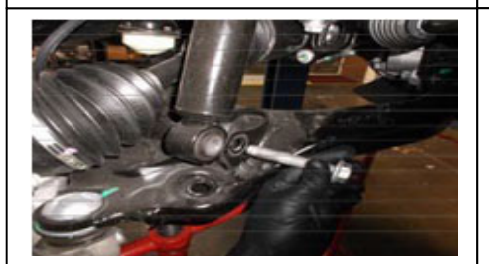
Loosen the lower control arms at the frame using a 24mm socket. Then unbolt the strut from the lower control arm using a 21mm socket.