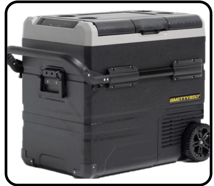
Waypoint™ & Basecamp™ Fridge

Jeep®, Gladiator®, and JT® are registered trademarks of Stellantis N.V.