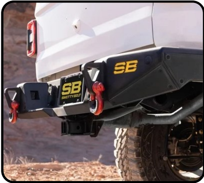
JT XRC Gen 2 Rear Bumper

Thank you for choosing Smittybilt accessories for your Jeep Gladiator® needs! If you would like to view our full range of available overlanding accessories, please visit us at www.smittybilt.com