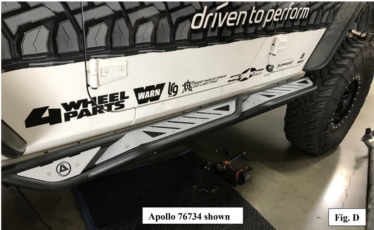
Apollo 76734 shown