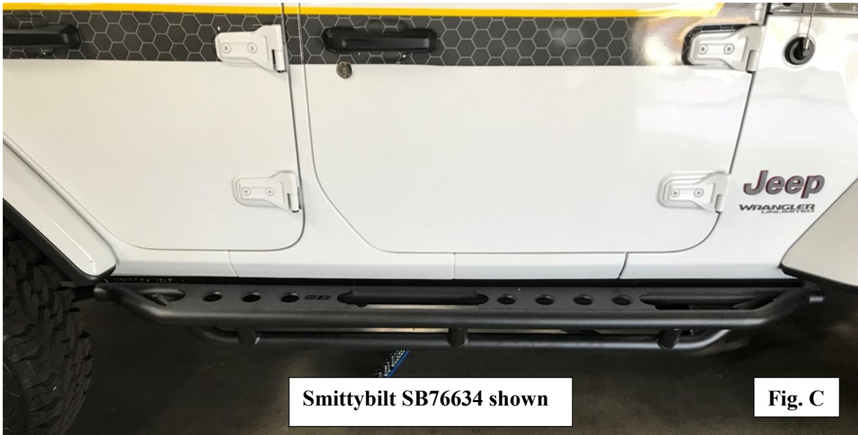
Smittybilt SB76634 shown

Step 5 : When both sides are adjusted, and you're satisfied with fitment, tighten and torque all hardware to 50ft-lbs. Install is complete. (Fig C, SB76634) (Fig D, Apollo 76734)