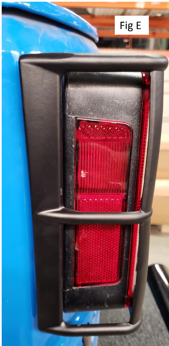
Passenger side shown.

Step 6: Repeat steps 1-5 for opposite side of vehicle.