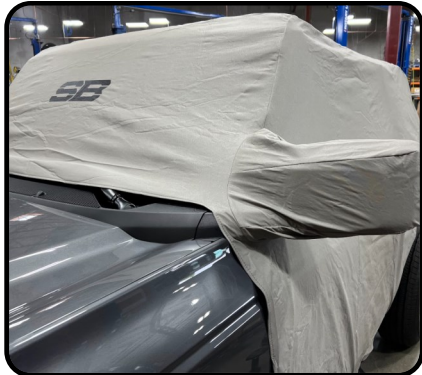
Bronco® Cab Cover

Thank you for choosing Smittybilt accessories for your Ford Bronco® needs! If you would like to view our full range of available vehicle and overlanding accessories, please visit us at www.smittybilt.com