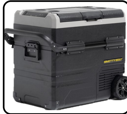
Waypoint™ & Basecamp™ Fridge

Ford® and Bronco® are registered trademarks of Ford Motor Company.