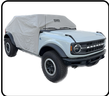
Ford Bronco® Cab Cover

Thank you for choosing Smittybilt accessories for your Ford Bronco®. If you would like to view our full range of available accessories, please visit us at www.smittybilt.com