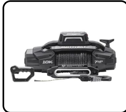
Recovery Gear and Winches

Ford® and Bronco® are registered trademarks of Ford Motor Company®