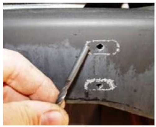
Step 4: Drill the locations that you just marked to ½". It is recommended to use a pilot hole 3/16" first. CAUTION: Be very cautious in this step. The vehicles fuel take is located behind the frame. (Figure 7, 8)

Jeep Rear Hitch (Part # JH44) 1987-2006 Jeep Wranglers