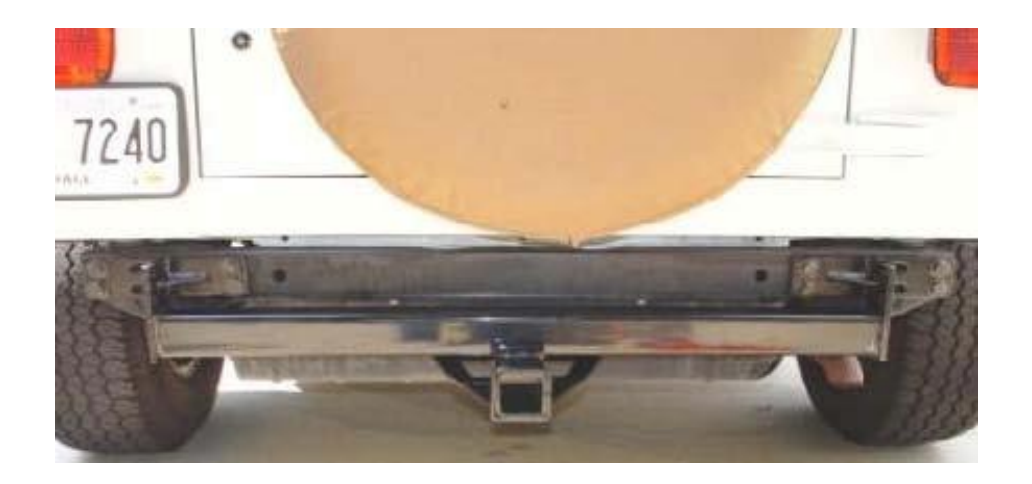
Step 5: Using (1) 10mm bolt, (2) 10mm flat washers, (1) 10mm lock washer, and (1) 10mm nut at each of the 8 holes, attach the hitch to the rear frame. Tighten all hardware at this time. Installation is now complete. (Figure 9)