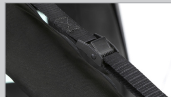
Heavy duty buckle system to prevent flapping