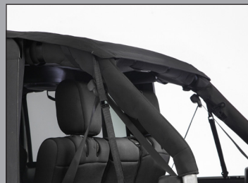
Bowless Combo Top open for summer