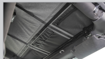
Front internal storage compartments for easy access