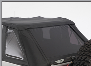
Bowless Combo Top for colder weather