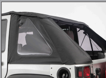
Bowless Combo Top partially open for warmer days