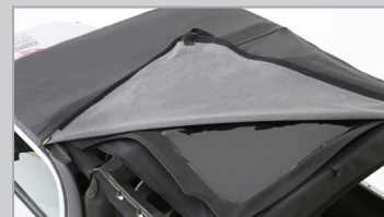
Easy storage and packing of side curtains