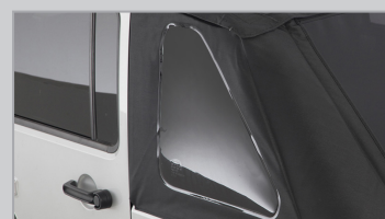
DOT approved tinted vinyl windows