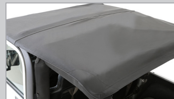
Durable materials resist fading and stretching