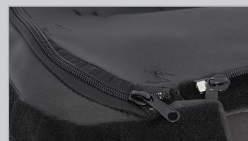
Self-correcting zippers run smoother and last longer