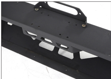
Unique triangulation anchor fastens to frame in multiple locations