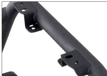
Integrated Gen2 light mounting tabs on the bull bar