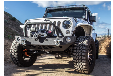
Raised corners for better entry and exit under the most extreme conditions