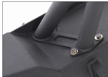
Removable bull bar 1.75" .120 wall overrider and kickers