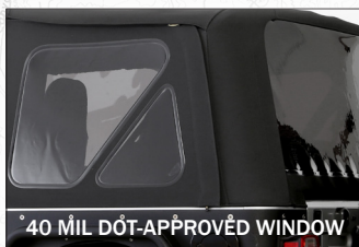
40 MIL DOT-APPROVED WINDOW