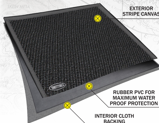
EXTERIOR STRIPE CANVAS