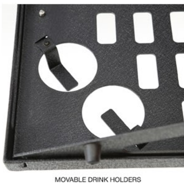
MOVABLE DRINK HOLDERS