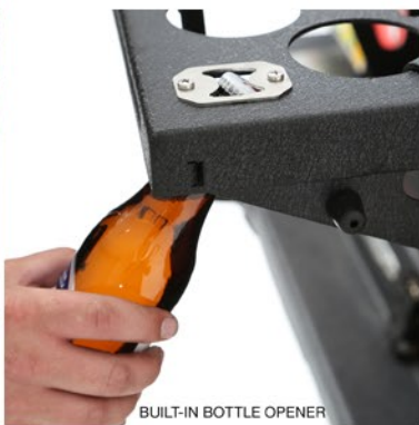
BUILT-IN BOTTLE OPENER