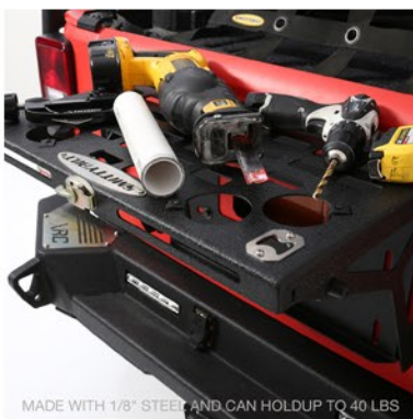
MADE WITH 1/8" STEEL AND CAN HOLD UP TO 40 LBS