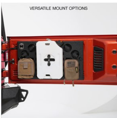
VERSATILE MOUNT OPTIONS