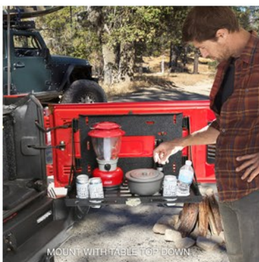
MOUNT WITH TABLE TOP DOWN