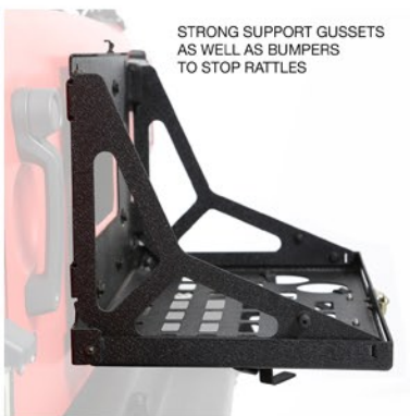
STRONG SUPPORT GUSSETS AS WELL AS BUMPERS TO STOP RATTLES