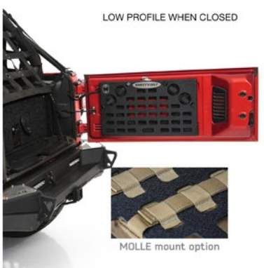
LOW PROFILE WHEN CLOSED