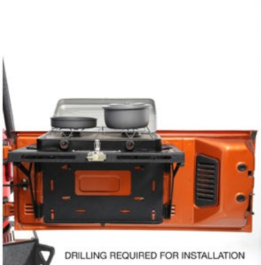
DRILLING REQUIRED FOR INSTALLATION