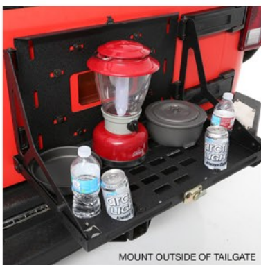
MOUNT OUTSIDE OF TAILGATE