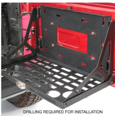
DRILLING REQUIRED FOR INSTALLATION