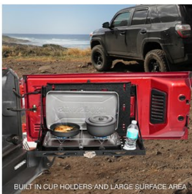
BUILT IN CUP HOLDERS AND LARGE SURFACE AREA