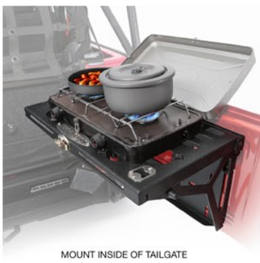
MOUNT INSIDE OF TAILGATE